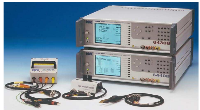
Accurate component analysis to 500 kHz (6430B) or 3 MHz (6440B) is simplified by many accessories which includes Overload Protection Unit 1J1100

The protection unit will protect the test equipment from up to 25 Joules of charged energy.